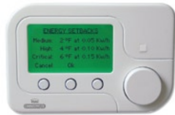
Displays Energy Setbacks for medium, high, and critical energy rates. These automatic temperature setbacks allow you to save money on energy bills if rates were to change.*