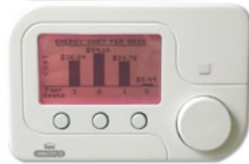
This graph allows you to monitor your Energy Cost, broken down by a specified time determined by your energy company.*