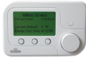
Displays Energy Details such as current cost as provided by your utility company.*

Advanced interaction between your home and your utility company can result in reduced energy usage and bills! Contact your local utility company to encourage their participation.